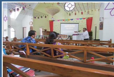
Two Days Retreat at Gandhinagar